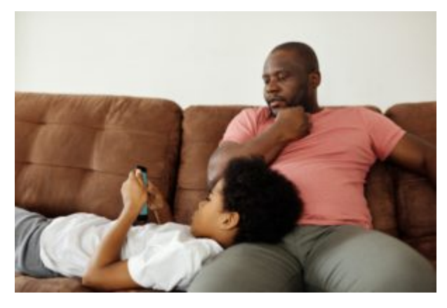
How DCTs Can Help Pediatric Clinical Research – Insights From Site Experts

Overcoming challenges in long-lasting pediatric clinical trials – Insights from site experts