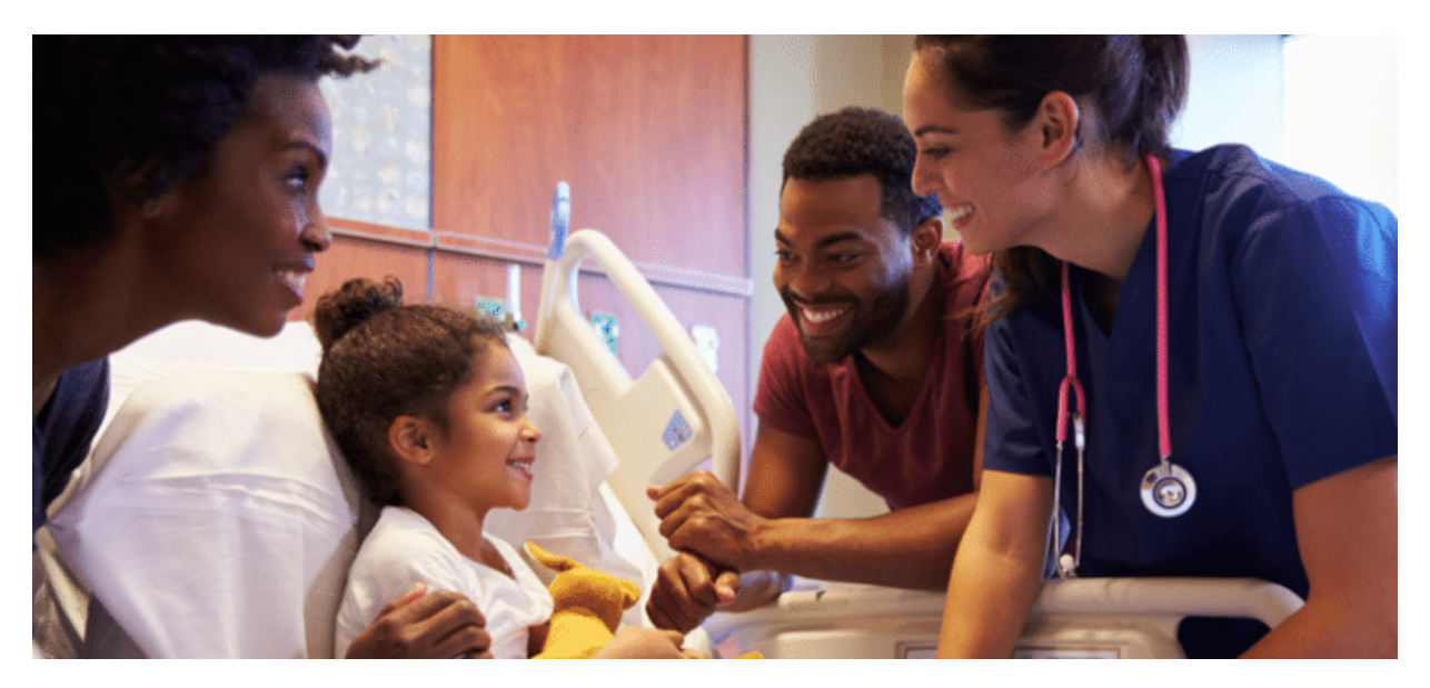
Exploring The Specific Challenges Of Pediatric Clinical Trials – Insights From Site Experts

Check out the "Clinical Trial Chronicles" podcast on Spotify for more insights on clinical trials!